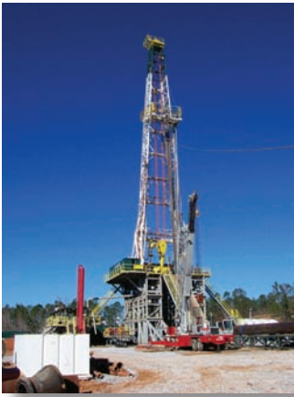
Well drilling rig

A: Underground natural gas storage can be used to balance the load requirements of gas users. Storage fields are the warehouses that provide a ready supply of natural gas to serve the market during periods of high demand.