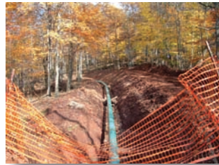
Pipeline in trench

A trench is a long narrow ditch dug into the ground and embanked with its own soil. They are used for concealment and protection of pipeline. Trenches are usually dug by a backhoe or by a specialized digging machine.