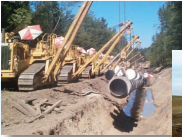
Inspection and repair of coating