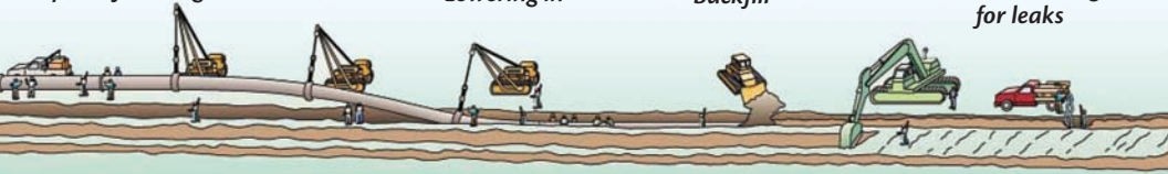
Pressure testing for leaks