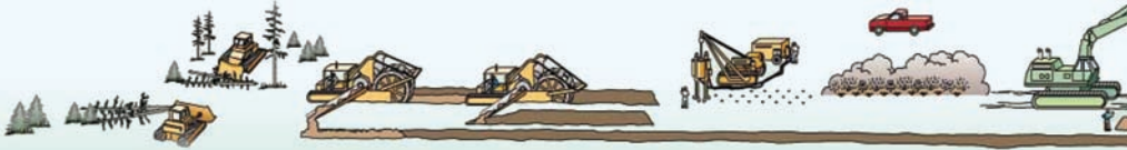
Clearing and grading

Moving assembly line (graphic not to scale)