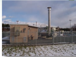
Metering and Regulating Station

Metering and regulating stations are installations containing equipment to measure the amount of gas entering or leaving a pipeline system and, sometimes, to regulate gas pressure.