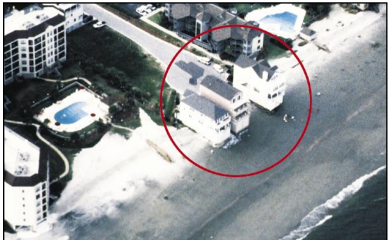
Figure 1. Well-built but poorly sited building.

A well-built but poorly sited building can be undermined and will not be a success (see Figure 1). Even if a building is set back or situated farther from the coastline, it will not perform well (i.e., will not be a success) if it is incapable of resisting high winds and other hazards that occur at the site (see Figure 2).