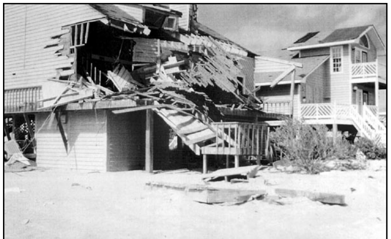
Figure 2. Well-sited building that still sustained damage.