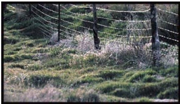
Barbed wire recently restrung on ancient fence posts. The fence exists ten feet into an adjoining property. Adverse possession or a permissive use?

Of note, in the United States, where title to property is held under a Torrens title (also called land registration or land court title), adverse rights cannot be advanced. Although not common, at this date, twenty states have passed land registration systems. Those states are California, Colorado, Georgia, Hawaii, Illinois, Massachusetts, Minnesota, Mississippi, Nebraska, New York, North Dakota, Ohio, Oregon, South Carolina, South Dakota, Tennessee, Utah, Virginia and Washington. In 1958 California repealed its act for lack of use. Even in states with Torrens titles, the majority of real property is not held under such title. When investigating claims of adverse possession, the surveyor must be aware of whether a given parcel is effected by such registration.