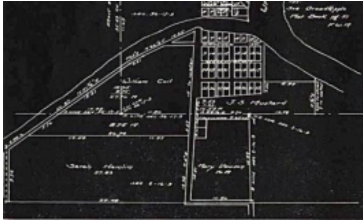
1878 survey. Recreating ancient lines and following original footsteps is often a challenge.

Many surveyors create maps that show both the “deed line” and “lines of possession,” not taking a position on issues of ownership. In reality, such a plan is not a boundary survey as much as an existing conditions plan that only serves to confuse all parties. A professional actively tries to ascertain lines of ownership, not dodge the very issues that may have caused his/her employment. If the surveyor cannot, after due analysis, properly reach conclusions about ownership when occupation differs from written instruments, his/her foremost duty is to then inform all parties of interest, noting that transfer of title by occupancy rights may have occurred.