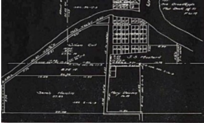
1878 survey. Recreating ancient lines and following original footsteps is often a challenge.

Many surveyors create maps that show both the “deed line” and “lines of possession,” not taking a position on issues of ownership. In reality, such a plan is not a boundary survey as much as an existing conditions plan that only serves to confuse all parties. A professional actively tries to ascertain lines of ownership, not dodge the very issues that may have caused his/her employment. If the surveyor cannot, after due analysis, properly reach conclusions about ownership when occupation differs from written instruments, his/her foremost duty is to then inform all parties of interest, noting that transfer of title by occupancy rights may have occurred.