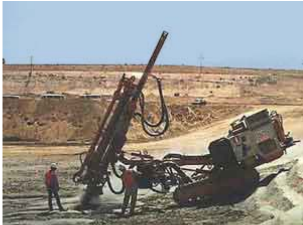
Figure 6: Before hiring a new drilling company, someone with experience should visit potential contractors to inspect the condition, quality and adequacy of their equipment. In the case above, it was discovered too late that the contractor hired could not drill angled borings within the specifications of the work order. Getting a new contractor wasted time and money, and set the project seriously behind schedule. The lowest bidder isn't always the best option. An adequate QA program can prevent such problems.

In addition to this plan, the procurement documents should also identify which records must be maintained by the supplier or contractor and which should be delivered to you before their material or work product is used. You should also require that the supplier or contractor permits you to visit their facilities and access records pertaining to your orders.